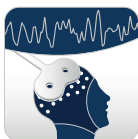
EEG & Brain Stimulation

Slim profile for close coil positioning; active electrodes for shortest recovery after artifacts